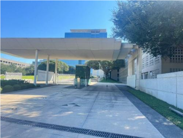
1. Enter through the CityWest Blvd guest entrance.