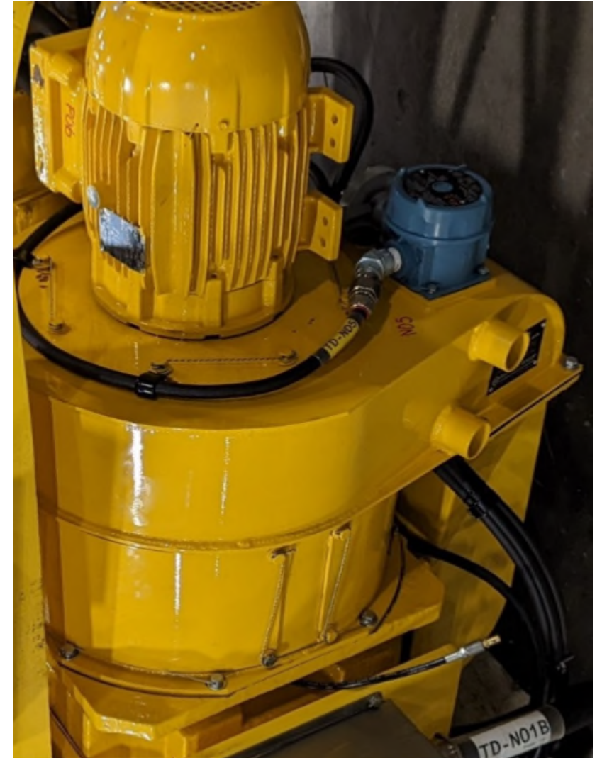
Cleaning Blower Upgrade on a TDS-11SA

Introduction of a cleaning blower upgrade for 400 hp drilling motors.