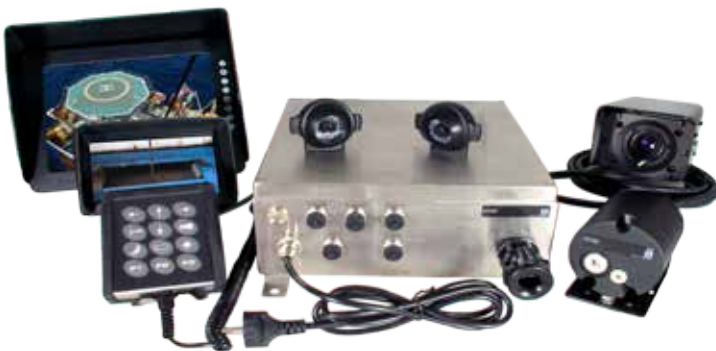
Crane Camera System components