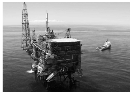
Classic full range Projects