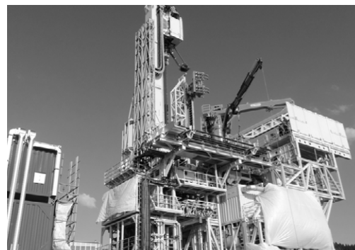
Maintenance, operation, upgrades & modifications