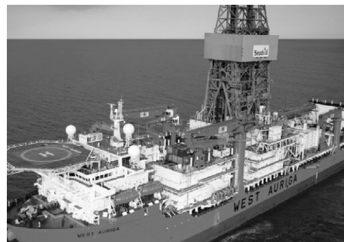
Floaters & Jack up & Drillship's