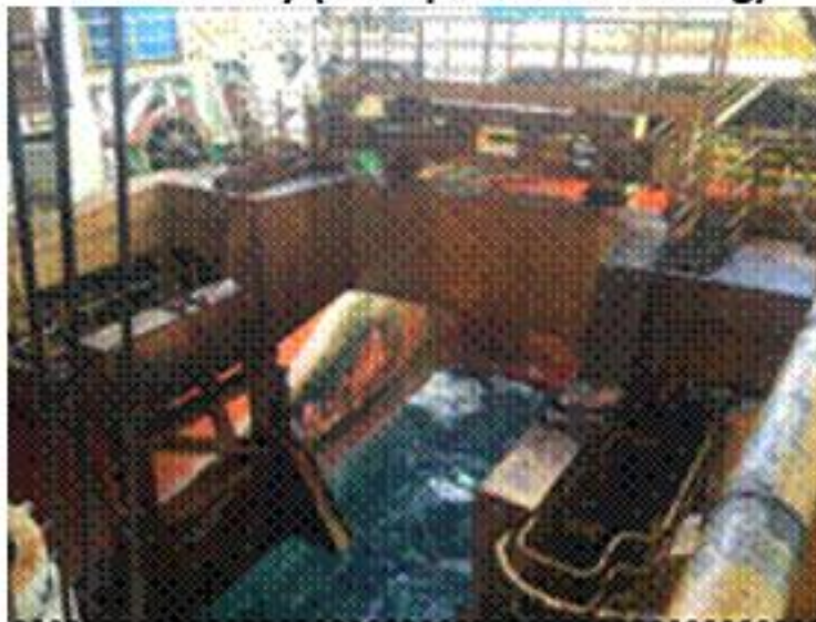
BOP Trolley Control Panel