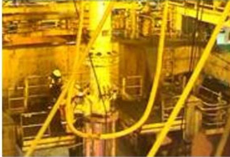
BOP Trolley (with platform missing)