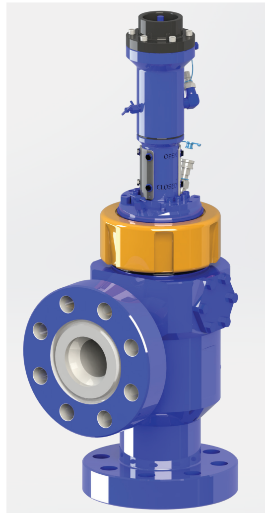
CX-HB3.0 Hydra-Balanced Choke