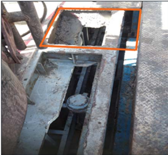
Figure 2 – Original position of the plate