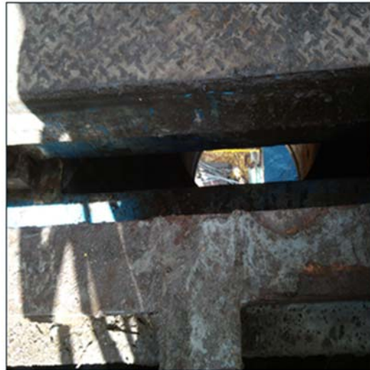
Figure 3 - Gap in rotary where plate fell through