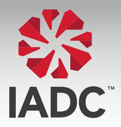
IADC Logo, 2014-Present International Association of Drilling Contractors