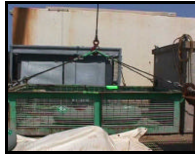
Figure 1: Similar cargo basket with incorrect sling angle.

While making a lift from a boat to the platform, the operator picked up a cargo basket and proceeded to swing away from the boat. While swinging the basket, the cargo suddenly shifted causing the O-ring on the latch side of the hook to pull through the latch. When the O-ring pulled through the latch, the two part sling came unhooked from the stinger and the basket dropped on one side resulting in dropping some of the cargo into the water. No injuries, but some of the cargo was lost.