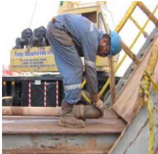
1. IP Straddles pipe

Rig personnel were in the process of laying down 5" DP and the injured person (IP) was working in catwalk area attempting to remove lifting caps. The employee operating the rig floor winch lowered the 5" drill pipe down the V-door slide to the catwalk and two nipples were placed under the pipe. Then the IP started to remove the lifting cap from the 5" drill pipe by standing on cat-walk with the drill pipe between his feet. He attempted to turn the lifting cap with his hands, but he failed to realize that he was moving the opposite end of the pipe on the rack. The pin end of the drill pipe fell off the side of the cat-walk causing the box end of the pipe to strike the IP legs. The pipe knocked the IP to the ground and then the pipe fell to the ground hitting and breaking his left leg.