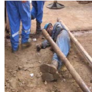
4. Pipe lands on IP.