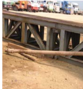
3. Pipe end rolls to edge of cat walk and falls