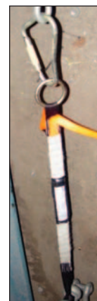
A substitute "weak link" can be fitted to the working end of the tugger wire. It could be a colored, visual "flag" to indicate a line snag.

This article is adapted from a presentation made at the IADC Lifting and Mechanical Handling Conference & Exhibition, held 11-12 April in Houston. ♠