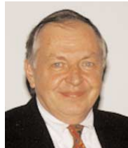
Robert D Wagner Jr

Tech Power expands facility. Tech Power Controls Co is building a new manufacturing facility adjacent to its headquarters in southwest Houston, doubling its total manufacturing assembly area.