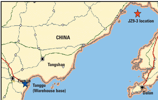
JZ9-3 field was a near ideal application for one-trip multi-zone system.

"Even with the relatively inexpensive costs in the Bohai Bay area, using the Mini-Beta system resulted in saving more