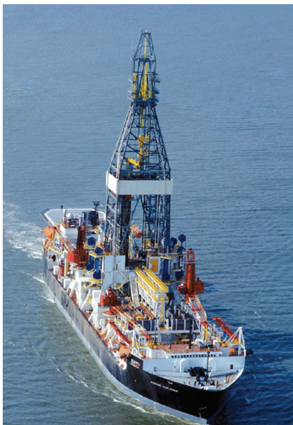
GlobalSantaFe's GSF Explorer is pictured here working for BHP Petroleum in the ultra-deep-water Gulf of Mexico.

THE US GULF of Mexico is one of the most puzzling offshore drilling regions due to its lack of drilling activity in light of sustained high commodity prices and various royalty relief incentives implemented by the Minerals Management Service (MMS). Drilling activity in terms of rigs contracted continued to decrease steadily since December 2003, and few believe there will be any significant increase in drilling throughout most or all of 2004 and possibly into 2005.