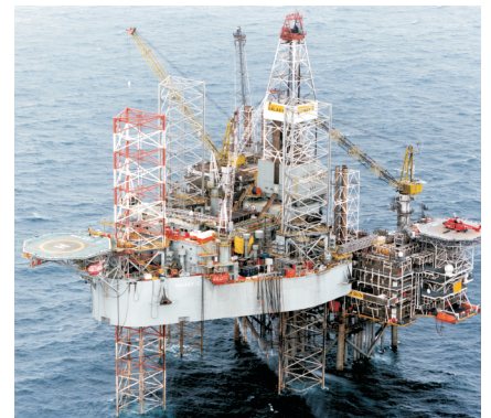
GlobalSantaFe’s Galaxy I is drilling in the North Sea for Apache.

“There are a lot of short-term projects visible,” Mr Cosby noted, “so it is possible the market might look quite good,