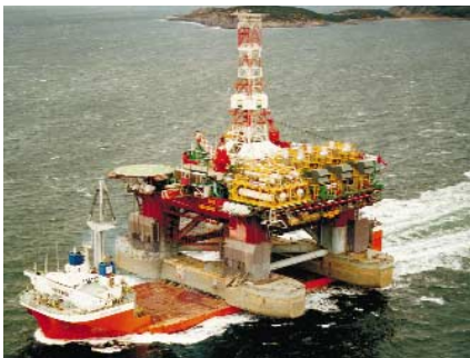
Dockwise's Mighty Servant 1 set a new record in transporting the 32,767-ton semisubmersible Petrobras 36.