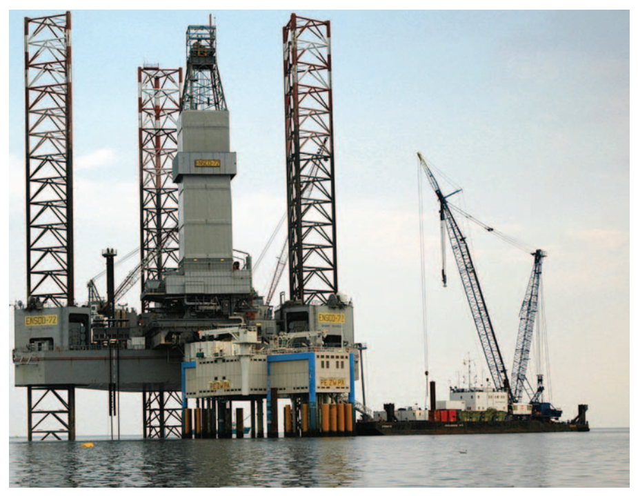
ENSCO International's ENSCO 72 jackup went through upgrades and enhancements to enable the rig to work in the environmentally sensitive Waddenzee off The Netherlands.

The controls for the noise requirements were clearly set out in the drilling permit, however, the surveying, consultation, manufacturing and re-testing of the upgrades were performed by local com-