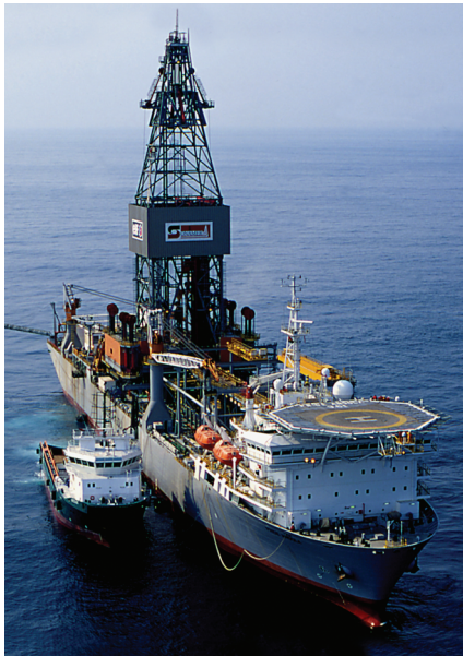
Pride International's drillship Pride Angola is drilling for Total off Angola under a contract that expires in 2010.

Diamond Offshore's semisubmersible Ocean Nomad, rated for 1,200 ft of water, recently completed a contract with Premier offshore Guinea Bissau with a dayrate in the high $40,000. That rig mobilized to Gabon for Vaalco/SASOL for three wells plus options for a rate also in the high $40,000. The contractor is pursuing additional work for the rig.